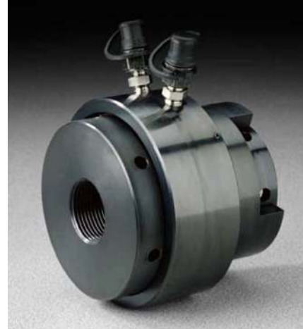
HYDRAULIC EXTERNAL TENSIONER (HET)